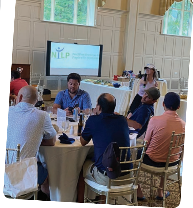
NILP reached $50,000, the highest grossing Golf Tournament in its history.