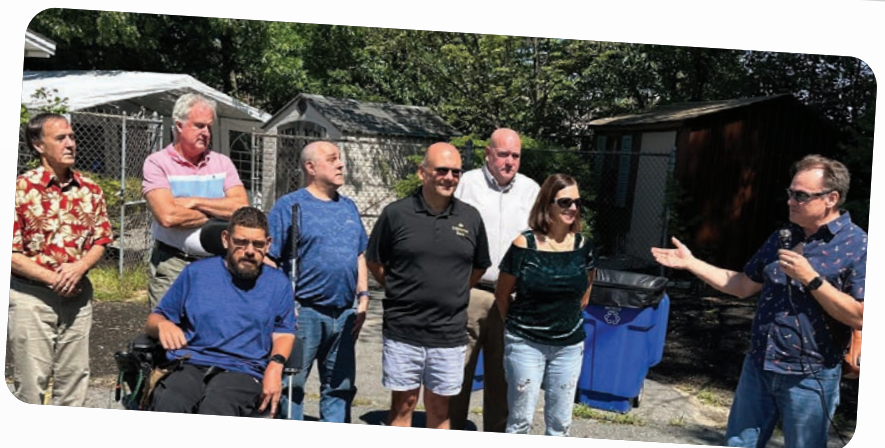
NILP Board of Directors