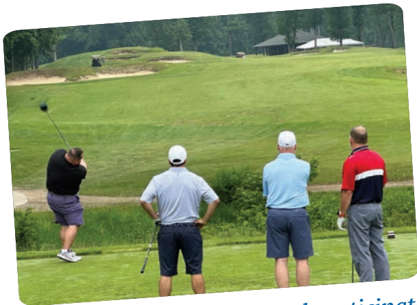
Over 95 golfers attended and participated in our most successful tournament to date.